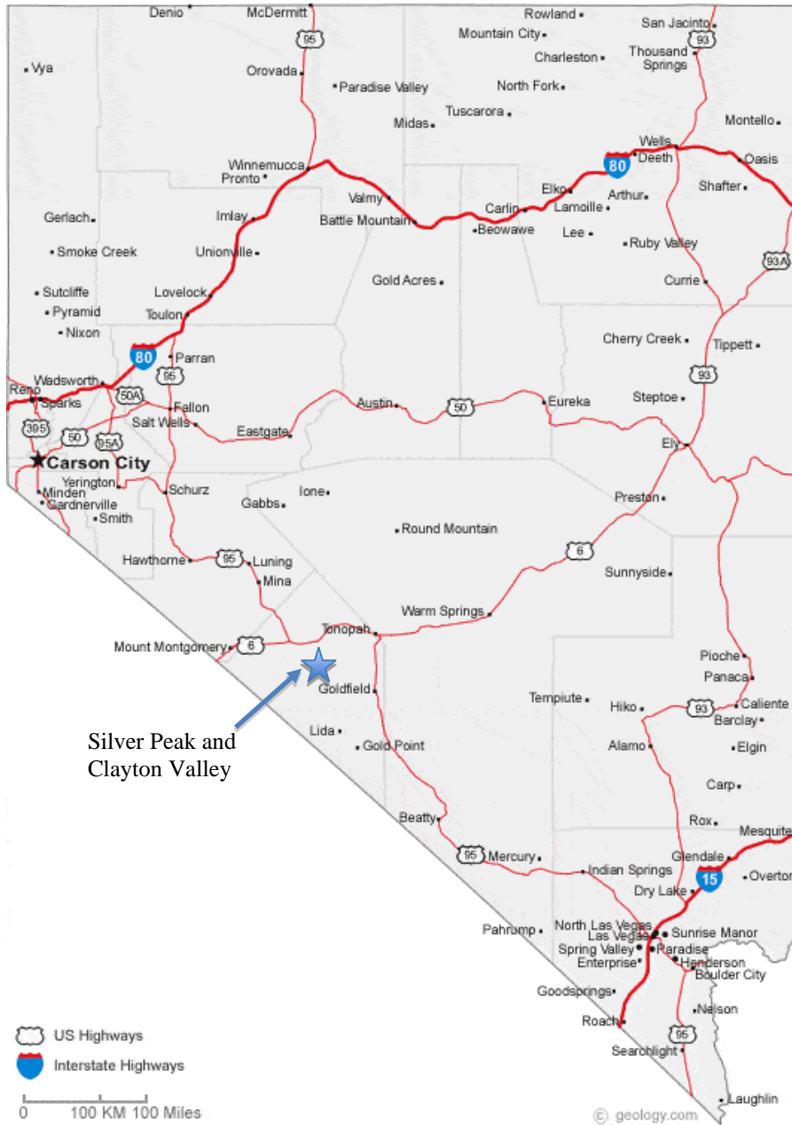
Figure 1: Clayton Valley Project Location Map